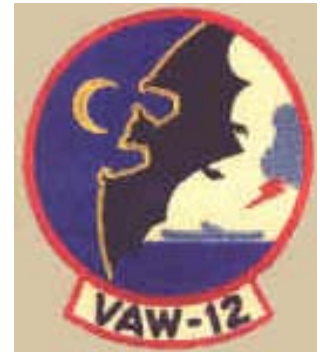
Patch available for sale